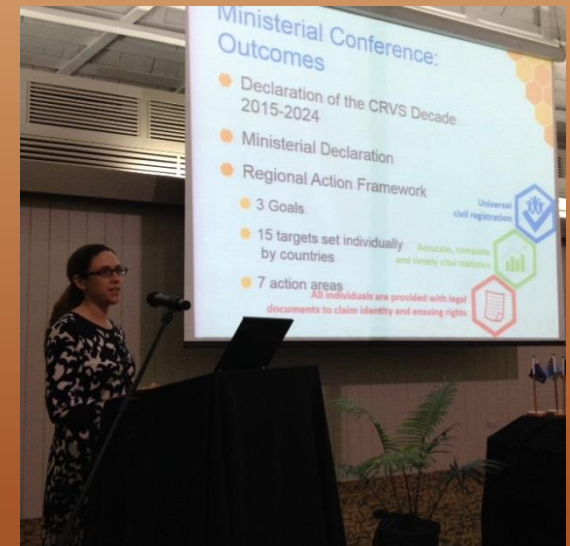
Pacific Civil Registrar Network