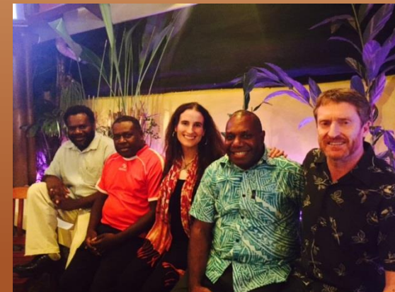
Pacific Civil Registrar Network