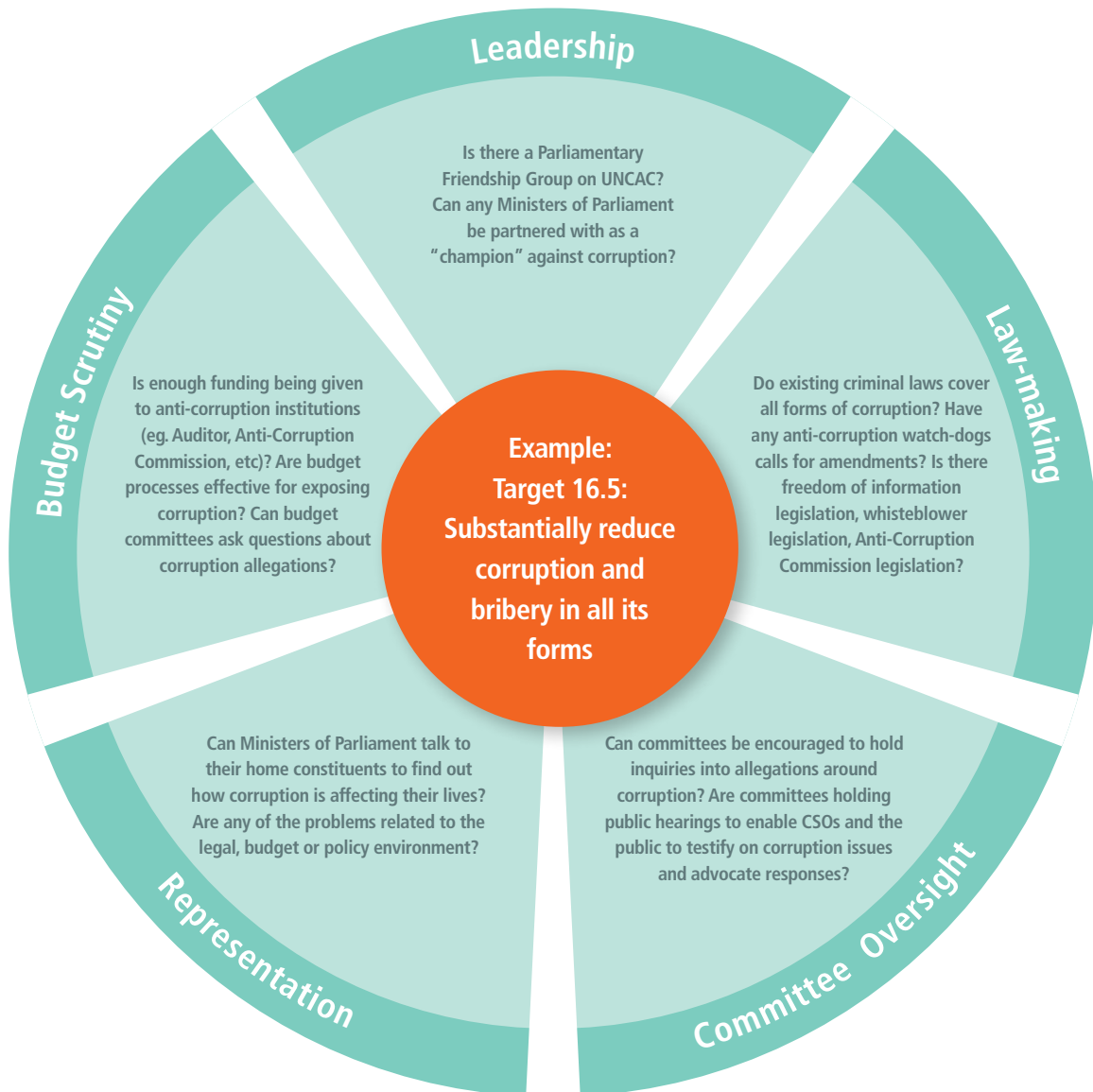
Figure 2: Example entry points for working with legislators

Although laws and amendments are commonly drafted by the executive branch, in many countries, members of the legislature can also propose their own laws (whether because the congress/assembly has its own law-making powers or through private members' bills). Where this is possible, individual legislators and/or coalitions of legislators could also be encouraged to develop draft laws. When legislators who are willing to sponsor a law or amendment are identified, civil society can provide them with technical assistance to put together a draft law. In