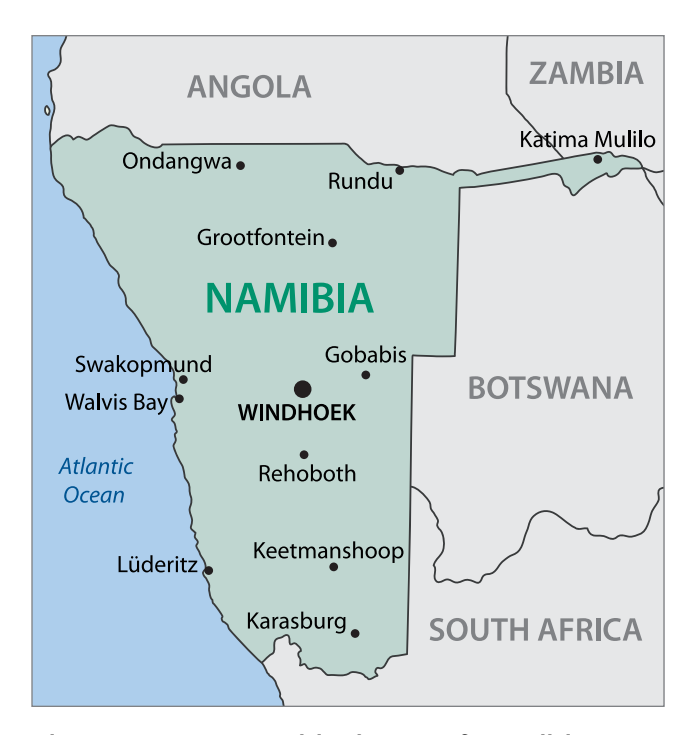
Figure 4.2: Geographical map of Namibia.

The Namibian Constitution provides for an election of the president as head of state, with a term of office of five years. The Namibian Parliament has two houses: the National Assembly and the National Council. The basis of the Namibian economy is mining for uranium, gold, silver, and base metals, as well as agriculture and tourism. Namibia is a member state of the United Nations (UN), the African Union (AU), the Southern African Development Community (SADC), and the Commonwealth of Nations. The currency is the Namibian dollar while the South African rand is also accepted as legal tender.